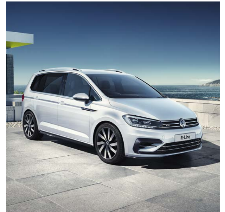
Model shown is Touran R-Line with optional LED premium headlights.

Please allow up to 28 days for your cancellation and refund to be processed.