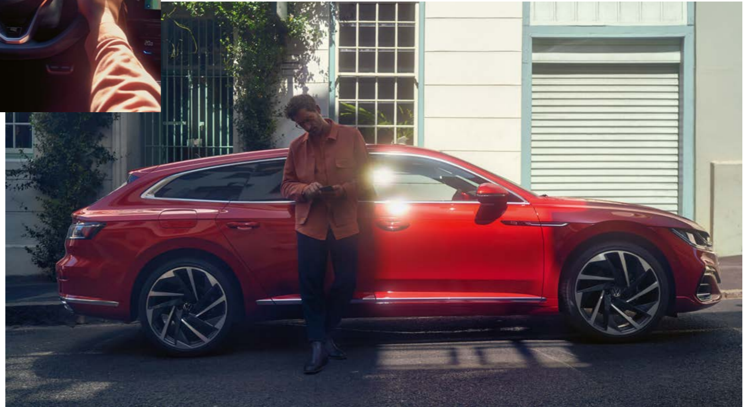
Front cover model shown is new Tiguan R-Line with optional 'IQ. Light' LED headlights and metallic paint. Model shown on this page is new Arteon Shooting Brake R-Line with optional 20" 'Nashville' alloy wheels, Dynamic Chassis Control (DCC), 'IQ. Light' LED headlights, Park Assist and metallic paint.