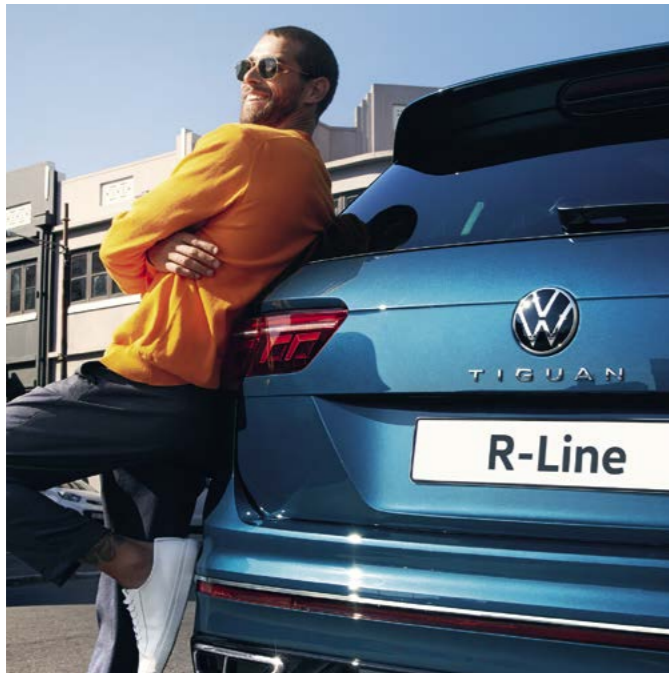
Model shown is new Tiguan R-Line with optional 'IQ. Light' LED headlights and metallic paint.

Whenever the following words or expressions appear in your policy, they have the meaning given below. For ease of reference, defined words or expressions in your policy are shown in bold type.