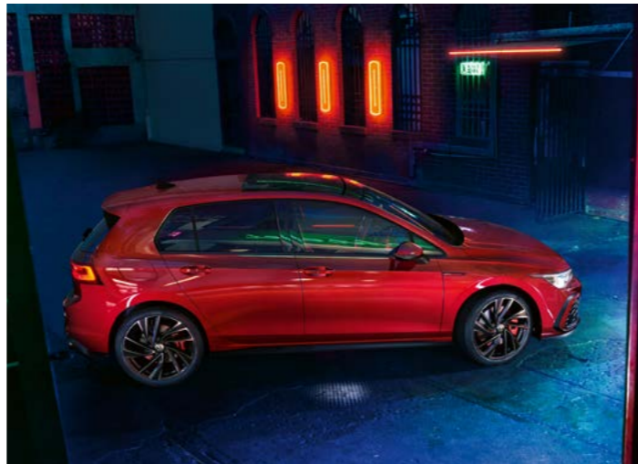
Model shown is new Golf GTI with optional 19" 'Adelaide' Black diamond-turned alloy wheels. 'Vienna' leather upholstery, panoramic sunroof and metallic paint.

The total amount you have agreed to pay us for this insurance policy. If you have not paid your premium , we will not provide cover from the date the premium was due. If the monthly payment option has been chosen and any instalment is not paid your policy will end 30 days after the date the missed instalment was due.