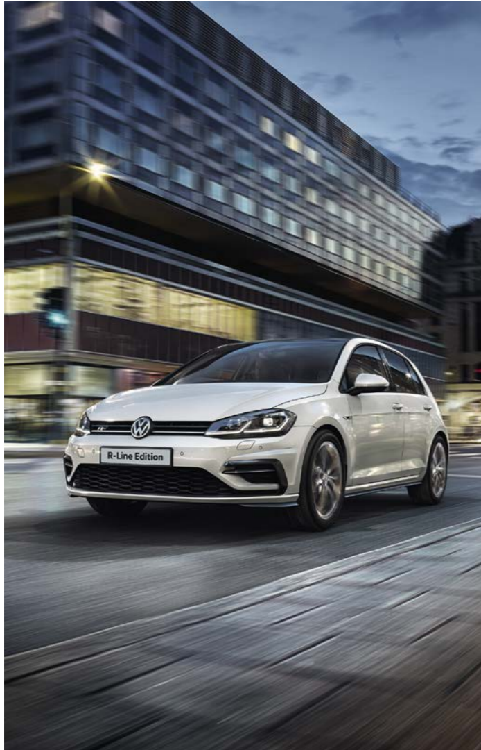
Model shown is Golf R-Line Edition with optional 18" 'Sebring' alloy wheels, panoramic sunroof and Oryx White premium signature paint.