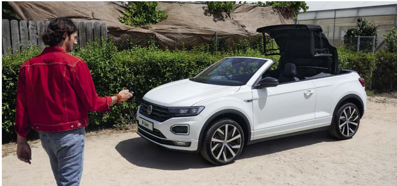
Model shown is T-Roc Cabriolet R-Line with optional 19" 'San Marino' alloy wheels and non-metallic paint.

For further information, you can visit The Motor Ombudsman website at www.TheMotorOmbudsman.org or call their Information Line on 0345 241 3008.