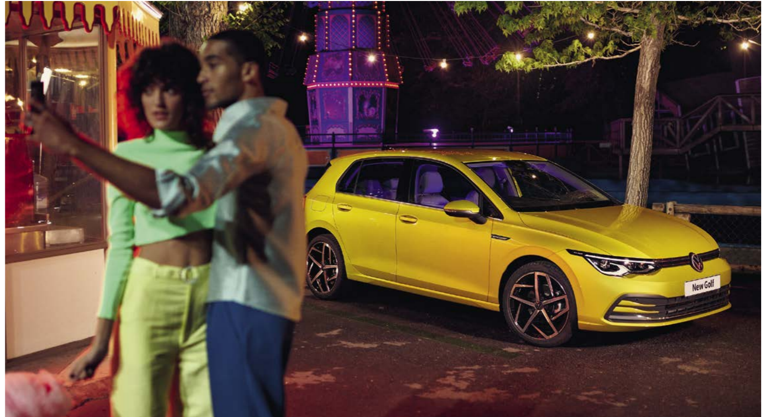
Model shown is new Golf Style with optional 18" 'Dallas' alloy wheels and 'IQ. Light' LED matrix headlights.

The maximum claim limit is based on your vehicle purchase price and is shown in your schedule .