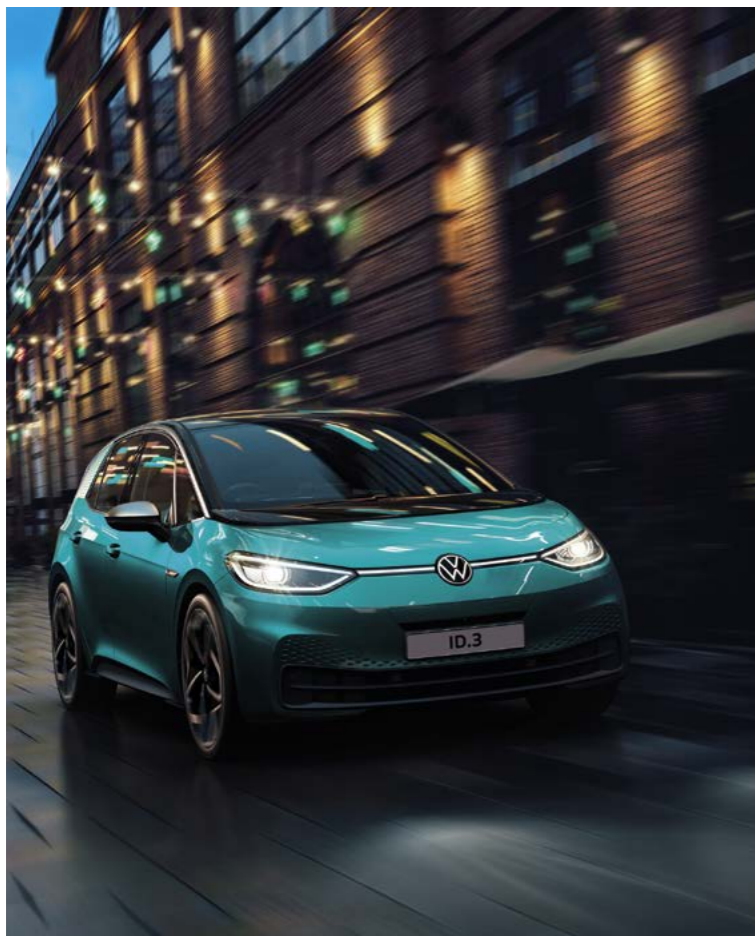
Model shown is ID.3 1 st Edition

Please also take a couple of minutes to check the details we hold for you on your schedule and tell us immediately if there are any mistakes.