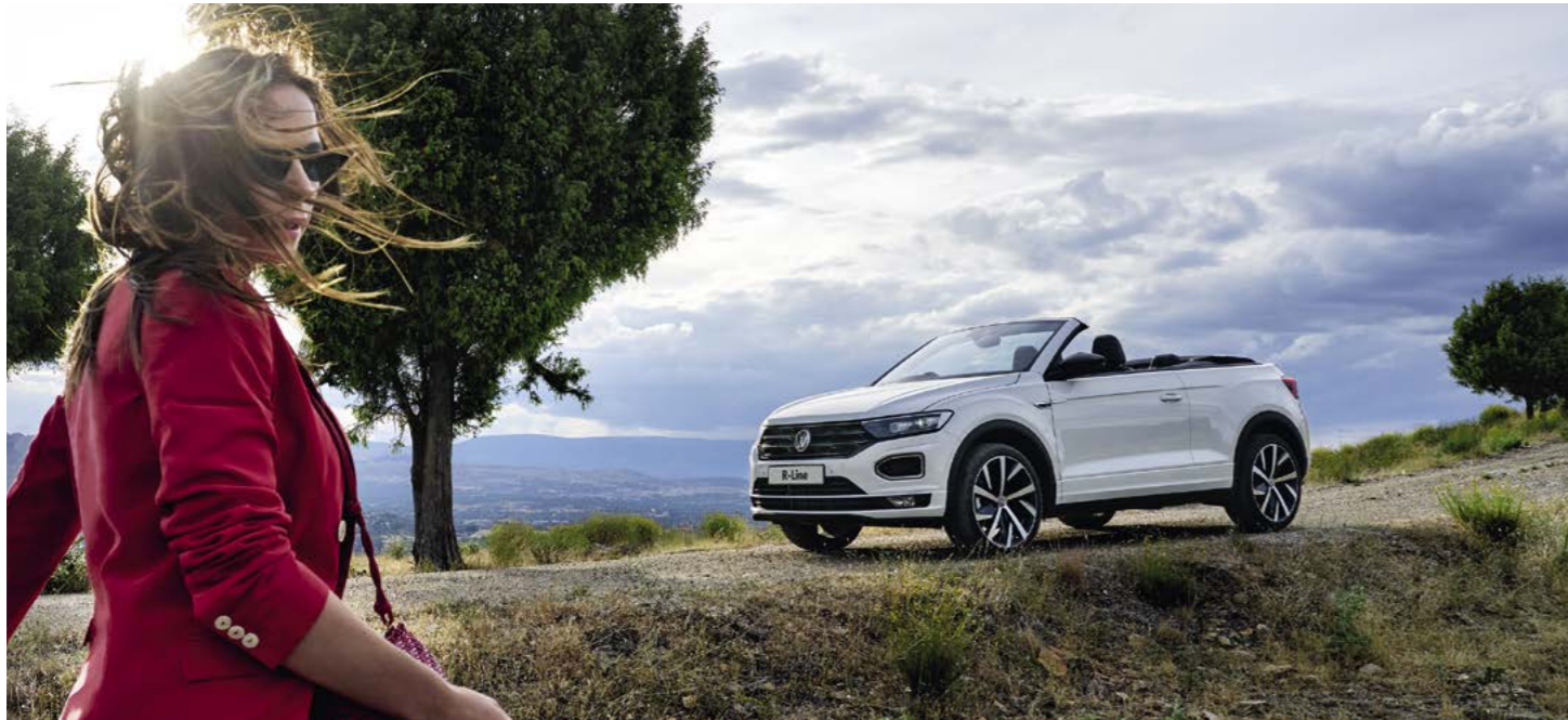
Model shown (above) is T-Roc Cabriolet R-Line with optional 19" 'San Marino' alloy wheels and non-metallic paint. Model shown (right) is new Arteon Shooting Brake R-Line with optional 20" 'Nashville' alloy wheels, Dynamic Chassis Control (DCC), 'IQ. Light' LED headlights, Park Assist and metallic paint.