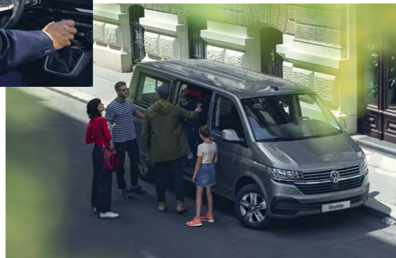
All images shown are for illustrative purposes only. Vehicles shown are not UK specification.